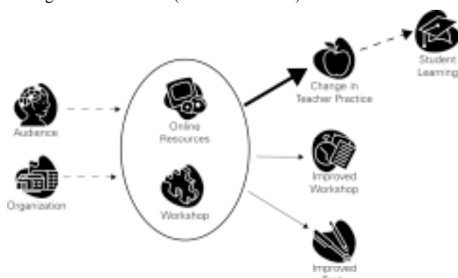
Figure 1. Evaluation framework

The framework guiding our evaluation studies is illustrated in Figure 1. The evolution of this framework was partly based on a review of the literature in teacher instruction in and adoption of information technology. It also resulted from iterative testing and refinement (described below).