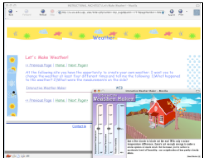
Figure 4. Example IA user project

The workshop curriculum, designed to help participants integrate digital libraries resources in teaching, follows these guidelines. By using the IA, and its simple authoring and sharing capabilities, the workshop is design-oriented, hands-on, and collaborative. In addition, several aspects of the curriculum can be tailored to fit audience and institutional contexts.